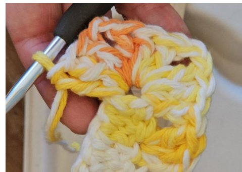
Figure 4 The top right shows a granny cluster in the space , then a chain-2; the top shows another granny cluster into the space ; the top left shows another chain-2 then another granny cluster