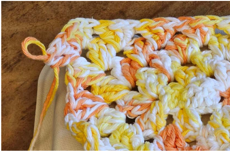
Figure 8 In Round 4 insert 2 granny clusters side by side into the corner spaces without chain stitches in the middle (essentially 6 double crochets).