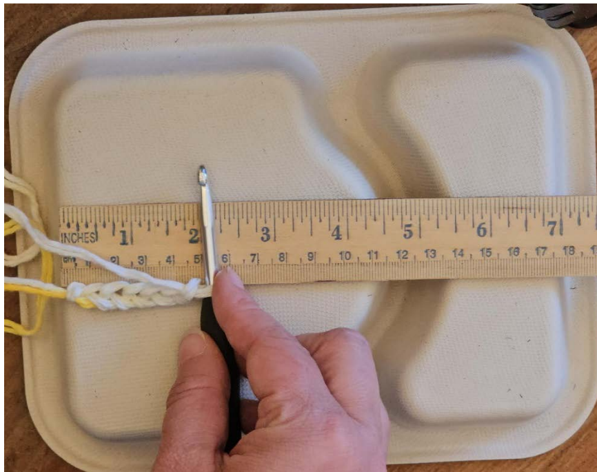
Figure 1 Adjust your hook or stitches until you have a chain-6 that is 2 inches long.

Foundation Chain: Use a double strand of #4 cotton yarn for this project. Chain 6 for two inches. Adjust your stitches or hook until you achieve a 2-inch chain-6. Fig 1 Once your gauge is achieved, chain 2 more to be the turning chain.