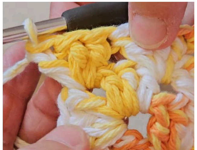
Figure 9 In Round 5 insert 1 granny cluster between the 3 rd and 4 th corner double crochets from the previous round.

Round 6: Switch to double crochet this round.