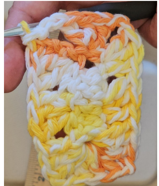
Figure 6 first round of granny clusters complete.

Round 2-3: Each granny cluster will now be worked into the space between the clusters in the previous round.