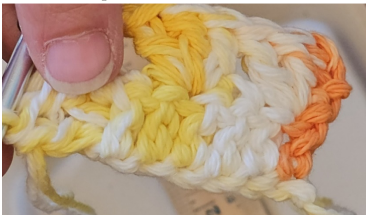
Figure 3 Foundation round of double crochet at the bottom; first granny cluster top right, skip two and next granny cluster top center