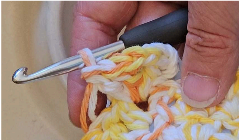
Figure 10 To turn outward for the handles, expand by inserting 2 double crochets in the corner stitch, chain 2, then insert 2 more double crochets into the same stitch.