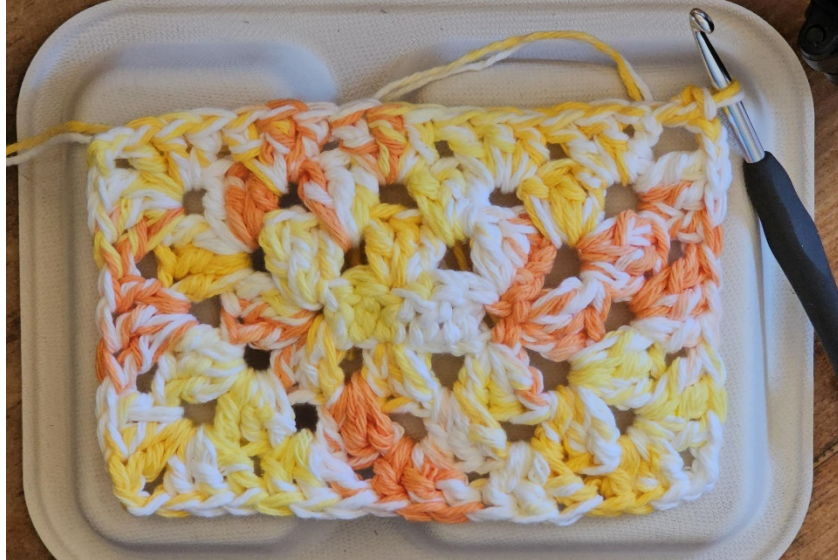
Figure 7 Rectangle is approximately 6.25 inches x 4.25 inches. It is short of the tray's bottom parameter.

Round 4: Begin going up the walls of the tray. This will be a soft turn up the walls, so the piece is intentionally short of the 7 inches x 5 inches goal.