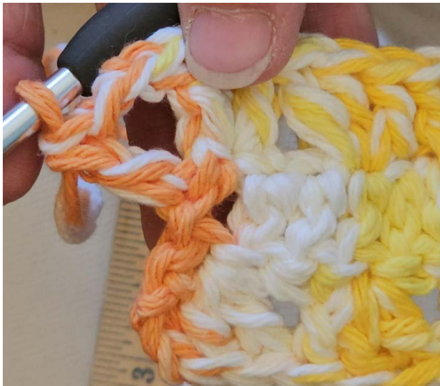
Figure 5 Top middle shows 3 double crochet, then a chain 2 for the next corner; left side shows the first double crochet of the next cluster in the side of a double crochet from the foundation row.