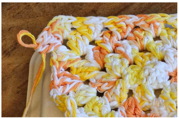
Figure 8 In Round 4 insert 2 granny clusters side by side into the corner spaces without chain stitches in the middle (essentially 6 double crochets).