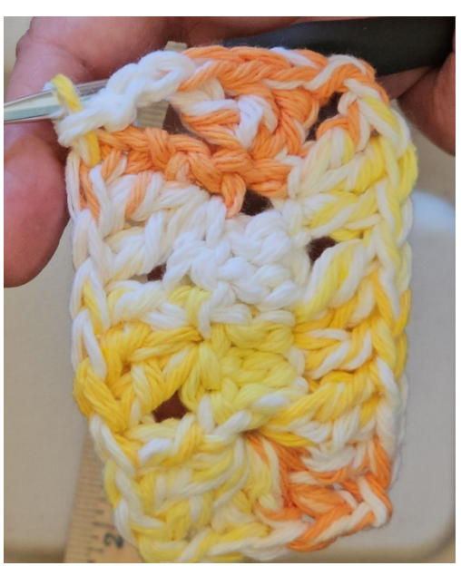
Figure 6 first round of granny clusters complete.