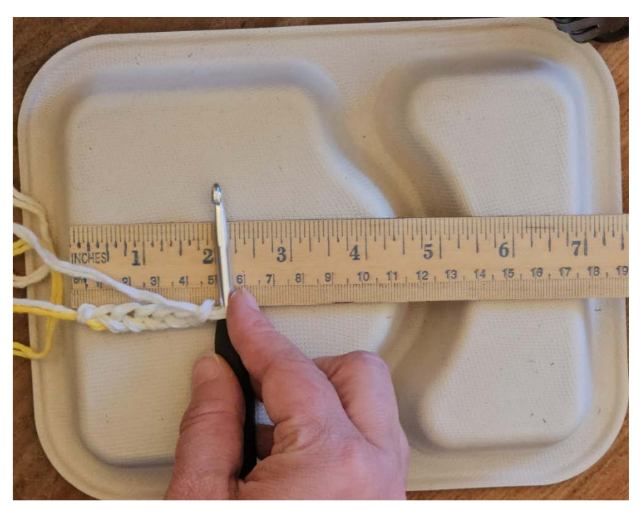
Figure 1 Adjust your hook or stitches until you have a chain-6 that is 2 inches long.

Foundation Chain: Use a double strand of #4 cotton yarn for this project. Chain 6 for two inches. Adjust your stitches or hook until you achieve a 2-inch chain-6. Fig 1 Once your gauge is achieved, chain 2 more to be the turning chain.