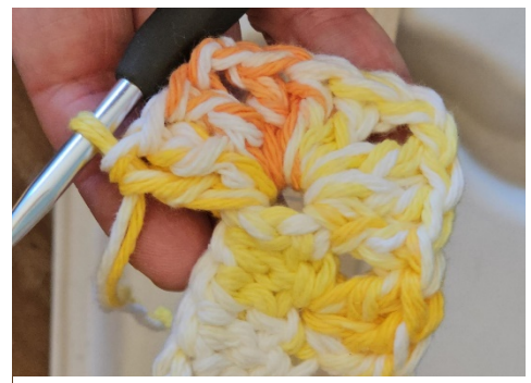
Figure 4 The top right shows a granny cluster in the space , then a chain-2; the top shows another granny cluster into the space ; the top left shows another chain-2 then another granny cluster