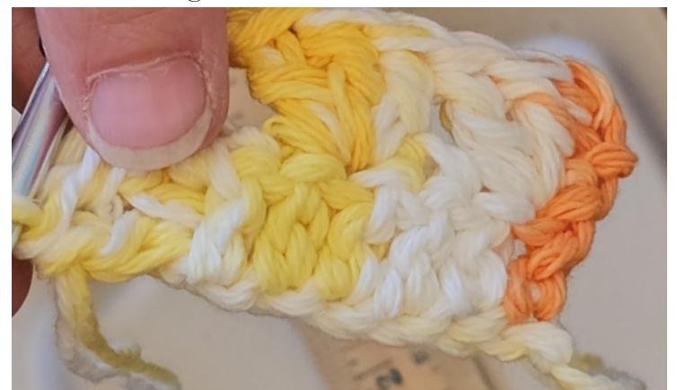
Figure 3 Foundation round of double crochet at the bottom; first granny cluster top right, skip two and next granny cluster top center

• Turn your work over. Chain 3 (counts as first double crochet). Work 2 double crochets into first stitch (your first granny cluster). Skip 2, and work 3 double crochets into the next stitch. Fig 3