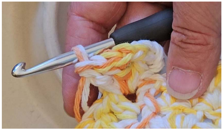
Figure 10 To turn outward for the handles, expand by inserting 2 double crochets in the corner stitch, chain 2, then insert 2 more double crochets into the same stitch.