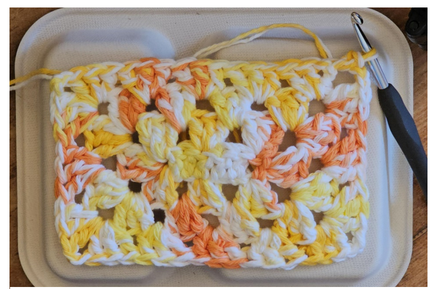
Figure 7 Rectangle is approximately 6.25 inches x 4.25 inches. It is short of the tray's bottom parameter.

Round 4: Begin going up the walls of the tray. This will be a soft turn up the walls, so the piece is intentionally short of the 7inches x 5inches goal.