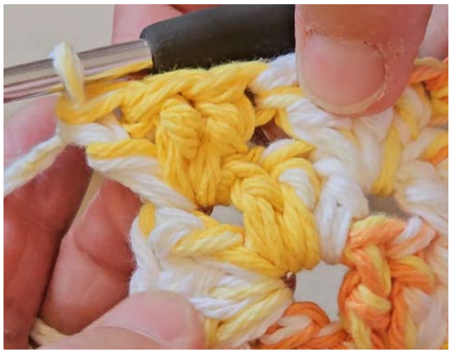
Figure 9 In Round 5 insert 1 granny cluster between the 3<sup>rd</sup> and 4<sup>th</sup> corner double crochets from the previous round.

Round 6: Switch to double crochet this round.