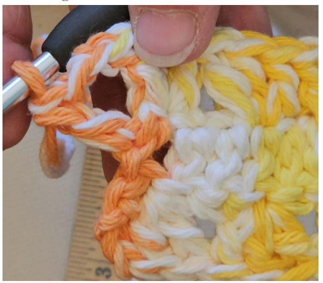
Figure 5 Top middle shows 3 double crochet, then a chain 2 for the next corner; left side shows the first double crochet of the next cluster in the side of a double crochet from the foundation row.